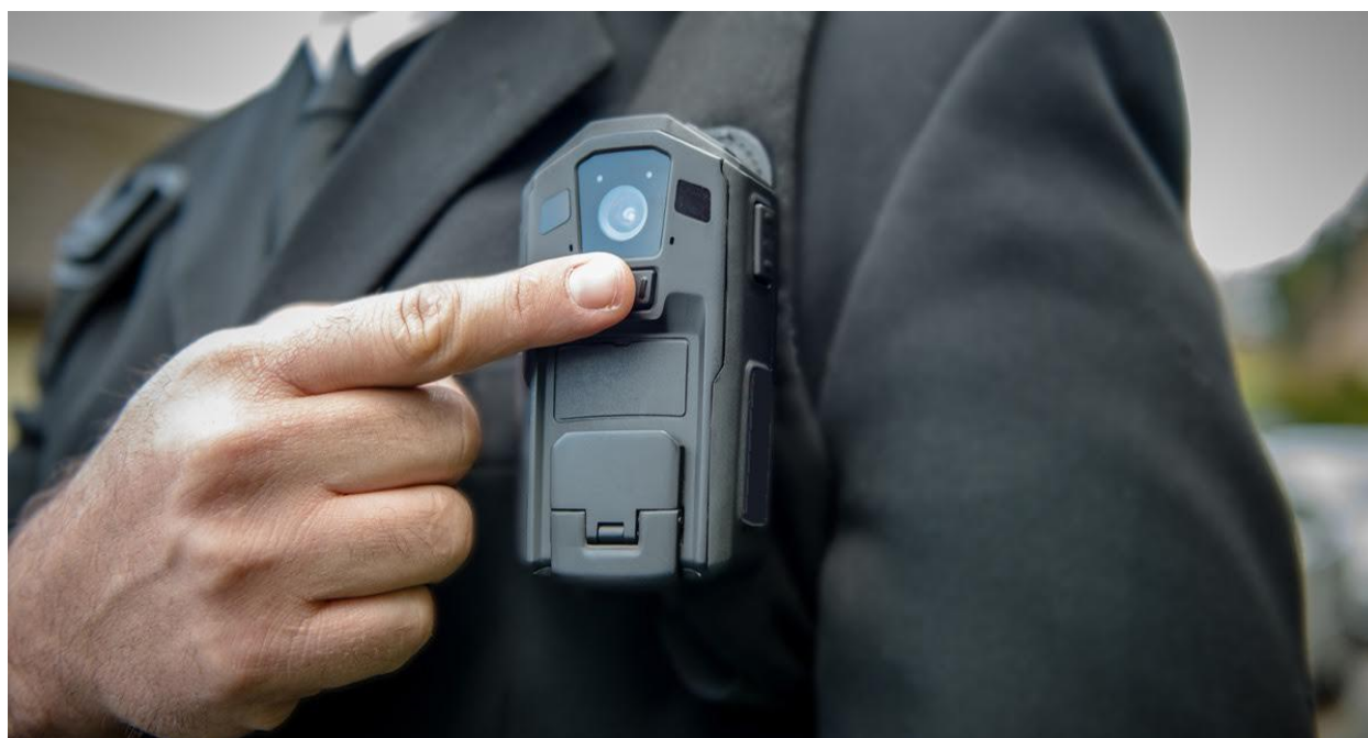
Figure 1. Front-mounted body-worn camera