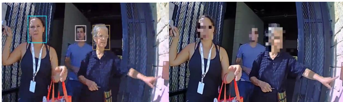
Figure 3. Example of Image Redaction

Another drawback to the older systems is that they do not allow for automatic activation and there have been problems with manual activation that jeopardize the usefulness of video evidence. (See Appendix C, Camera Activation and Public Release for further discussion of the topic.)