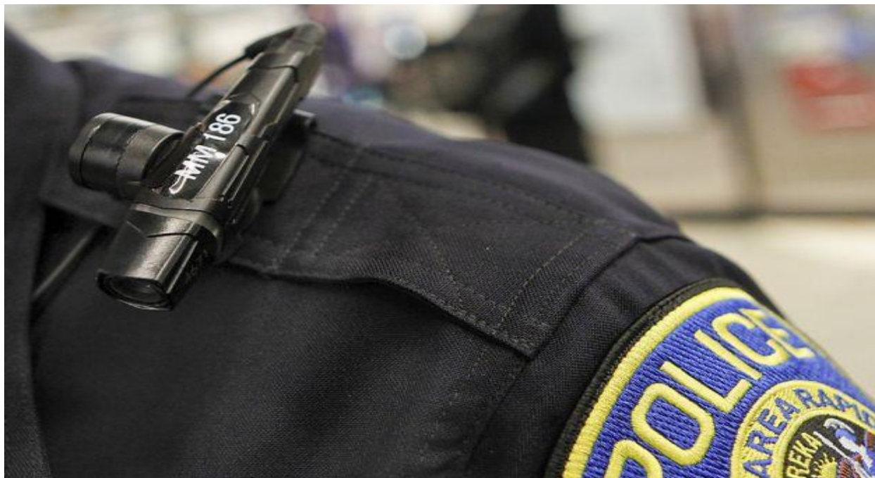
Figure 2. Body-worn camera mounted on uniform epaulet

The sophistication of the camera systems varies considerably. They range from basic devices with manual activation and output manually transferred onto local storage media (i.e., CDs or DVDs), to the latest in camera systems with advanced features and editing capability. Such advanced systems not only allow automatic activation of recording and better image quality, they also support more convenient processing of video images, such as tagging a video to a particular event, automatic uploading to storage media, and more convenient editing.